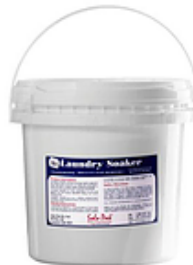
Dishwashing powder 1 pail