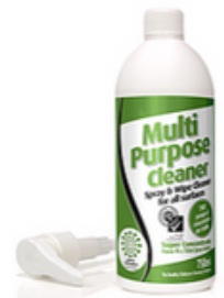
Multi-purpose cleaner 1 carton