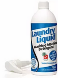
Laundry Liquid 1 carton