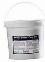
Laundry Soaker 2 pails