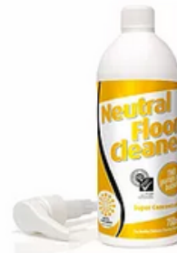
Neutral Floor Cleaner 1 carton