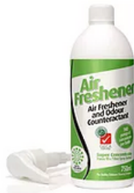
Air Freshener 2 bottles