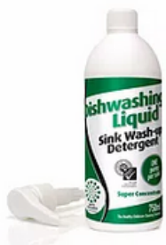
Dishwashing liquid 1 cartons