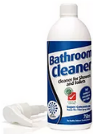
Bathroom Cleaner 1 carton