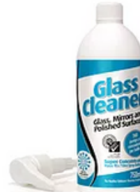
Glass Cleaner 1 carton