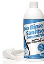
No Rinse Sanitiser 2 bottles